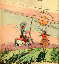
ILLUSTRATION SHOULD BE PROTECTED BY COPYRIGHT LAW